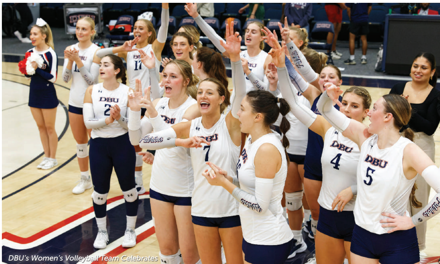
DBU's Women's Volleyball Team Celebrates