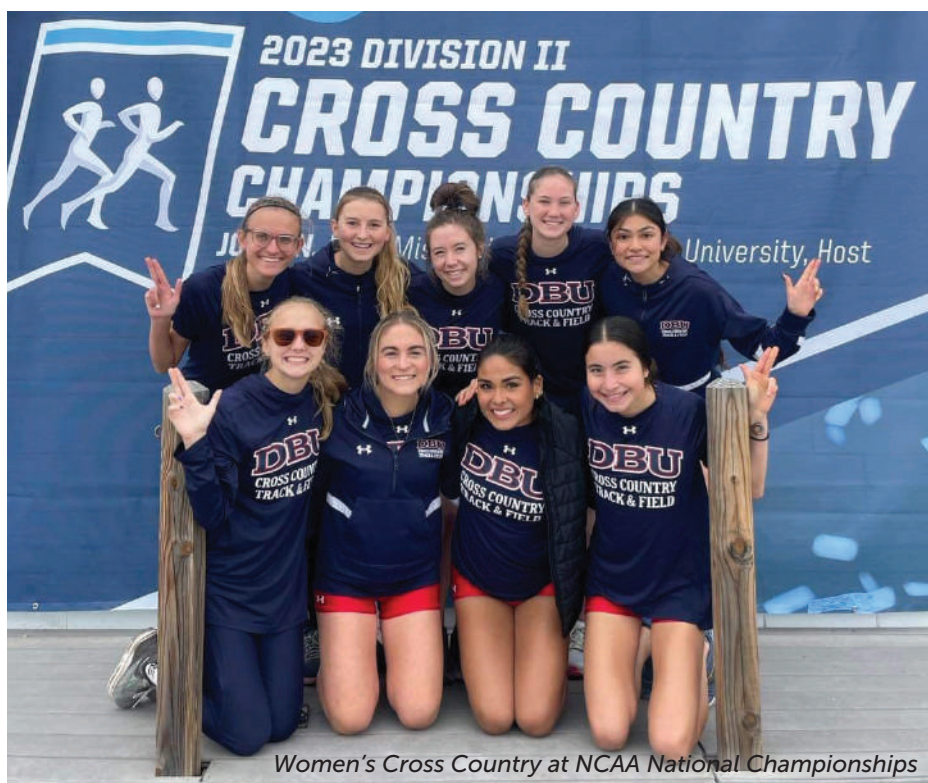
Women's Cross Country at NCAA National Championships