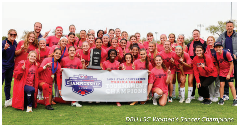
DBU LSC Women's Soccer Champions

On the men's side, DBU won their final two games of the regular season to claim a third-place finish in the Lone Star Conference standings, qualifying them for the LSC Tournament for the second consecutive year. Playing host to Texas A&M International in the first-ever conference tournament match at Patriot Soccer Field, DBU reached the semifinals after surviving double overtime and advancing with a 4-3 edge over the Dustdevils in penalty kicks. The Patriots would eventually reach the LSC Championship for the first time in program history after knocking off West Texas A&M, 5-4 in penalty kicks.